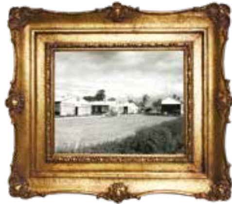
1961 - Egg production at Becketts Farm pre A435 Dual Carriageway

The A435 is upgraded to a dual carriageway connecting Redditch New Town with Birmingham. The original farm house is demolished and a replacement is constructed with a purpose built area for the Farm Shop Mark 2 . The A435 will become the busiest arterial road into Birmingham over the next 40 years.