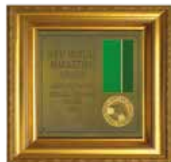
1984 - Becketts presented with NFU Marketing Award