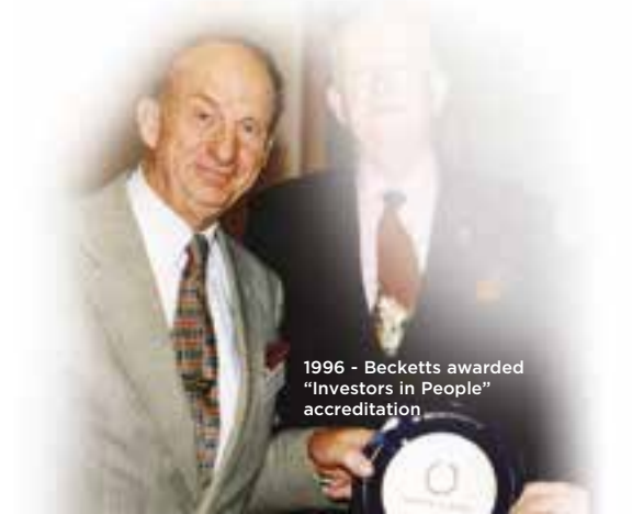
1996 - Becketts awarded "Investors in People" accreditation