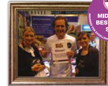
Becketts Farm stand at the NEC exhibition

Becketts Farm receives the accolade of 'Midlands Best Farm Shop' by the BBC Good Food Show. As part of the award, Becketts Farm hosted their own stand at the Good Food Show which was held at the NEC.